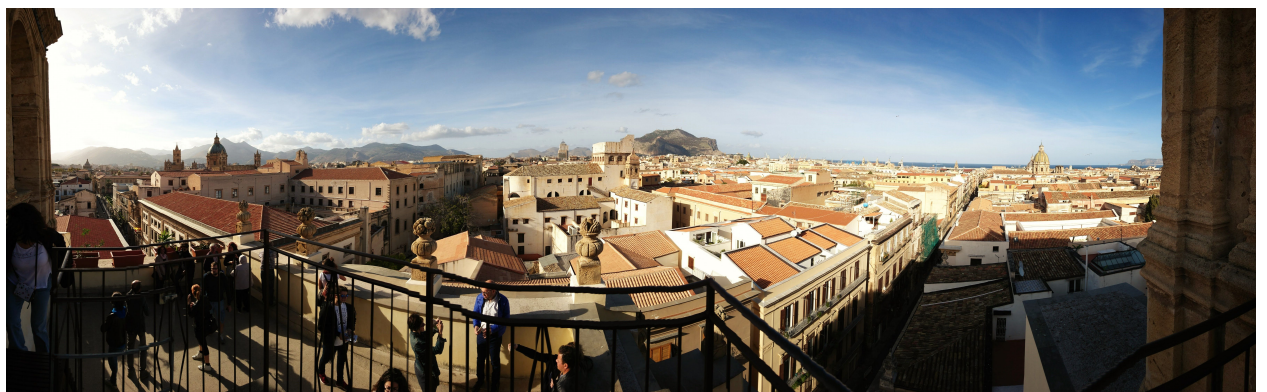
(Palermo and Monte Pellegrino in the background)

Shortly before I traveled to Palermo, I looked around the internet for apartments. In a specific Facebook group I found what I was looking for and made an appointment to view the accommodation. But you can also search for flats through the Erasmus Student Network (ESN). Generally, the housing situation in Palermo was good, you could quickly find a room and you could expect about 200 Euro rental costs.