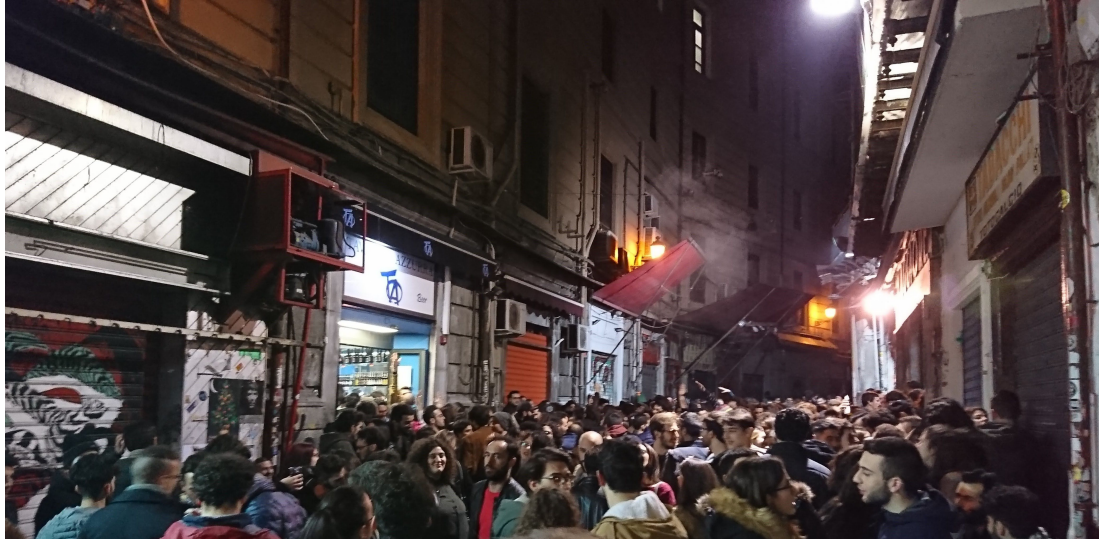
(Vucciria at night)

The streets of "Vucciria" and "Piazza Sant'Anna" invite you to be entertained for hours on end during day and night.