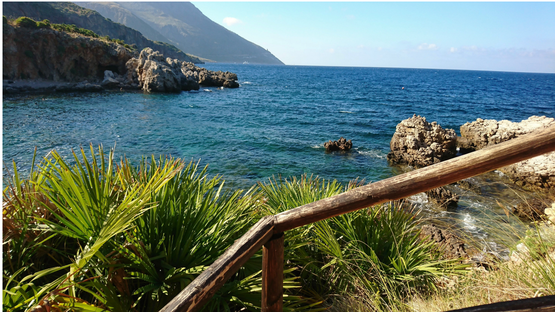
(Riserva naturale dello Zingaro)

Many of the more distant places can be explored on your own or you can take part in one of the ESN excursions that organize those trips.