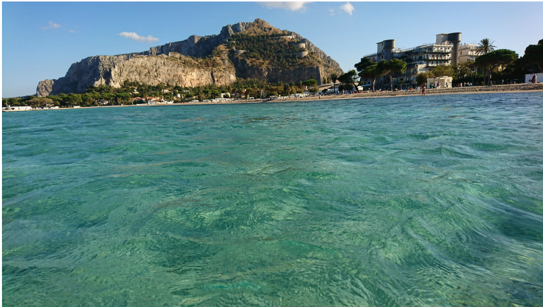
(Mondello and Monte Pellegrino)

Palermo is also located at the foot of Monte Pellegrino, a beautiful plateau-like mountain where you can go hiking on the weekend. (Mondello and Monte Pellegrino)