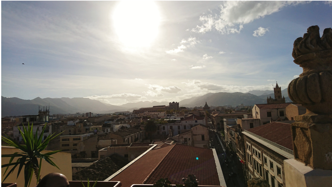
(View over the roofs of Palermo)

several Appelli, up to 3 per session, so you could choose the Appello best suited to your time schedule.